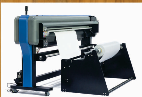
HEAVY DUTY ROLL FEED